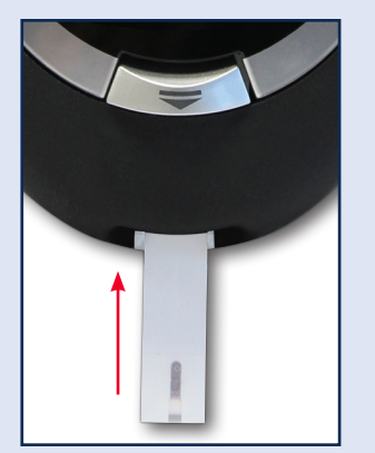
Step 3 Insert strip into Test Port with black blocks facing up. The meter turns on.

WARNING: Upon opening the test strip carton, examine the product for missing, damaged or broken parts. Ensure the test strip vial cap is securely closed. If the product is damaged or the vial cap is not closed, DO NOT use the test strips for testing; product may give inaccurate results. Contact Trividia Health Customer Care at 1-800-803-6025 for replacement and assistance.