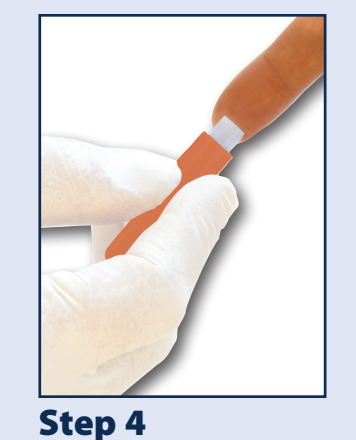
Refer to your facility approved method for lancing to obtain a blood sample. Select area on patient to be lanced. Clean and disinfect the area. Dry thoroughly. Lance fingertip. Allow blood drop to form.